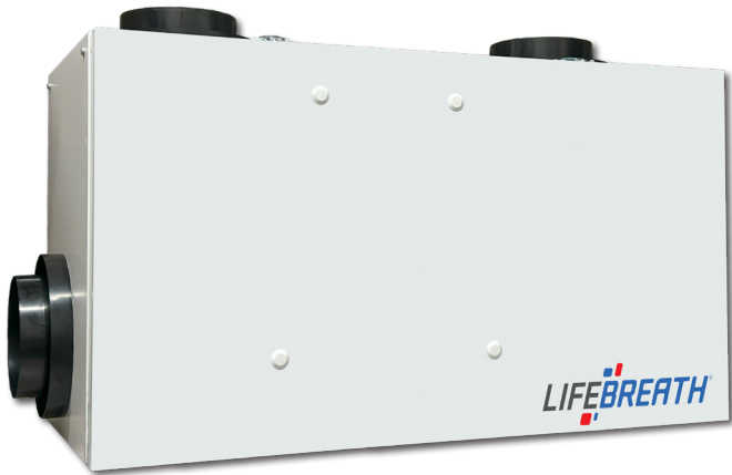
RNC 200 203 CFM @ 0.3 (75) IN. W.G. (PA)